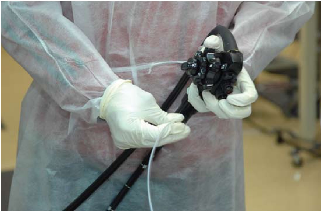
An endoscope is a medical device used by expert physicians to look inside the digestive tract.