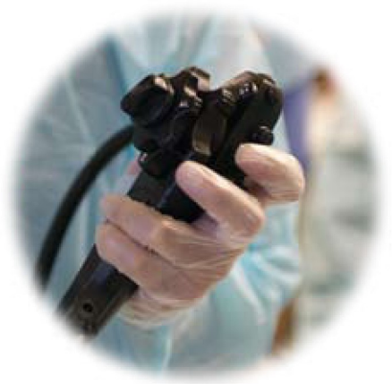
In preparation for PEG, an endoscope—a lighted flexible tube manipulated by a handle—guides the creation of a small opening through the skin of the upper abdomen and directly into the stomach.

PEG tubes can last for months or years. However, because they can break down or become clogged over extended periods of time, they might need to be replaced. Your doctor can easily remove or replace a tube without sedatives or anesthesia, although your doctor might opt to use sedation and endoscopy in some cases. Your doctor will remove the tube using firm traction and will either insert a new tube or let the opening close if no replacement is needed. PEG sites close quickly once the tube is removed, so accidental dislodgment requires immediate attention.