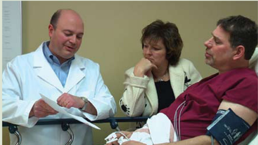
A colonoscopy screening exam is almost always done on an outpatient basis. The procedure typically takes less than 45 minutes.

Approximately 150,000 new cases of colorectal cancer are diagnosed every year in the United States and nearly 50,000 people die from the disease. It has been estimated that increased awareness and screening would save at least 30,000 lives each year. Colorectal cancer is highly preventable and can be detected by testing even before there are symptoms. The American Society for Gastrointestinal Endoscopy encourages everyone over 50, or those under 50 with a family history or other risk factors, to be screened for colorectal cancer.