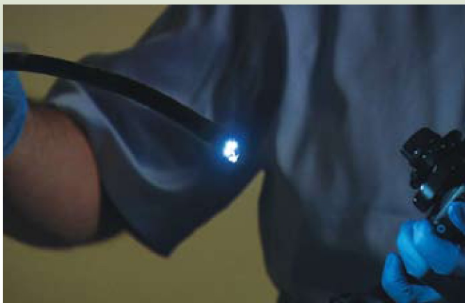
The endoscope is a thin, flexible tube with a camera and a light on the end of it. During the procedure, images of the colon wall are simultaneously viewed on a monitor.